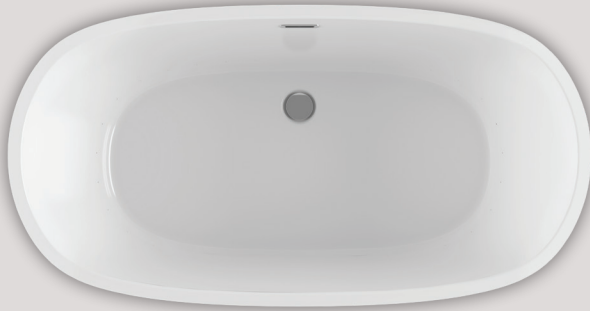
VIBE OVAL 5830 (FREESTANDING)