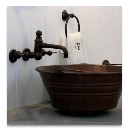
Shown in DB