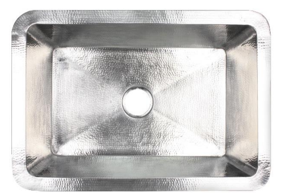
Shown in SS