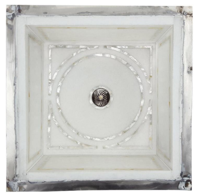
Shown with D013 PS-SCR02-N drain