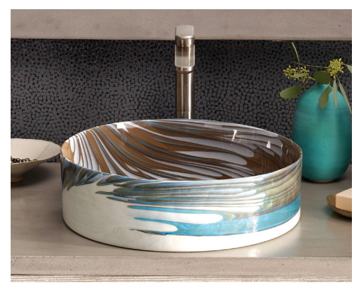
Shown in Shoreline

MG1616-AE Abalone MG1616-AS Abyss MG1616-BO Bianco MG1616-SE Shoreline