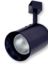
NTH-105B Black Roundback Cylinder with Black Baffle