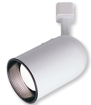
NTH-105W White Roundback Cylinder with Black Baffle