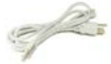
72" Cord & Plug

NUA-804B Black NUA-804W White Used to hardwire NUDTW-88 fixtures to NUA-802 or junction box (by others). Finish: Black or White