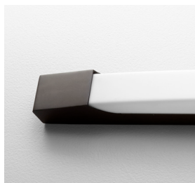
-22 Oiled Bronze