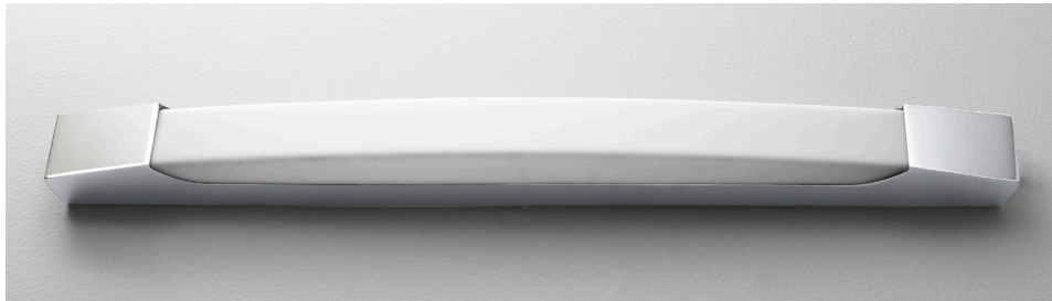
-14 Polished Chrome

FIXTURE TYPE _____ LOCATION _____ PROJECT _____ DATE _____