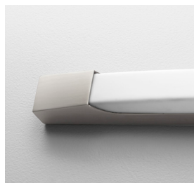
-24 Satin Nickel

LIGHT SOURCE 2 x 11.7W LED, 3000K, CRI 90 LUMINAIRE POWER 28.0W at 120V RATED LIFE 60000 hr RL OPTIONAL COLOR TEMPERATURES 2700K, 3500K, 4000K LUMEN OUTPUT Delivered: 2370 lm (LM-79) INPUT VOLTAGE 120V to 277V AC, 50/60Hz DRIVER OUTPUT 700mA, 29.4W max power DIMMING TRIAC and ELV dimming at 120V AC; 0-10V dimming, 100% to 1% current output CONSTRUCTION Plated Steel and Acrylic DIFFUSER - Matte White Acrylic FINISHES Polished Chrome (-14), Oiled Bronze (-22), Satin Nickel (-24) MOUNTING 4" Square J-Box* with a single device mud ring *Deep J-Box (Required to house driver) STANDARDS UL Dry/Damp listed, ADA Compliant, Conforms to UL STD 1598, Certified CAN/CSA STD C22.2 No 250.0.