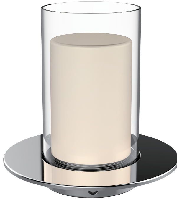
PT140986-CM Built-in Rechargeable Battery